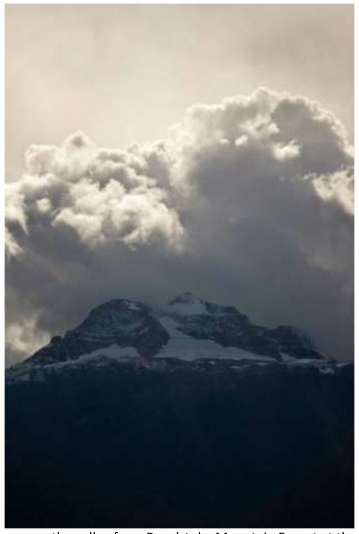
Sept 10, 2012 – Looking across the valley from Revelstoke Mountain Resort at the fresh snow on Mt. Begbie